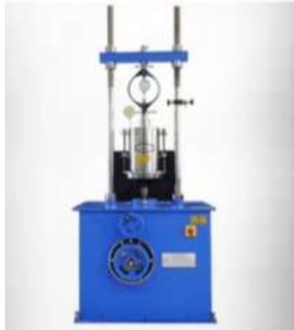
Fig. 1: CBR Test Apparatus

Consisting of Loading machine with capacity of atleast 5000 kg and equipped with a movable head or base which enables Plunger of 50 mm dia. to penetrate into the specimen at a rate of 1.25 mm/ minute.