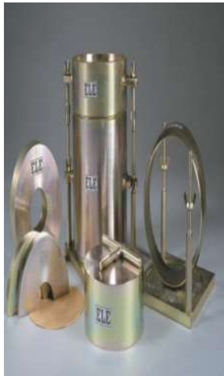
Fig. 2: CBR Mould with Base Plate, Stay Rod and Wing Nut

Consisting of Loading machine with capacity of atleast 5000 kg and equipped with a movable head or base which enables Plunger of 50 mm dia. to penetrate into the specimen at a rate of 1.25 mm/ minute.